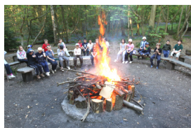
Cub Camp : Fri 20th to Sun 22nd May

If you have any questions about an activity please contact the organiser indicated by the initials in brackets above.